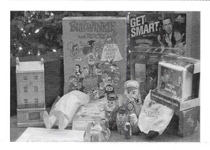
Items #26 - #32 of the Shiffman Collection